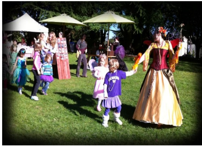
GAMES AND ACTIVITY