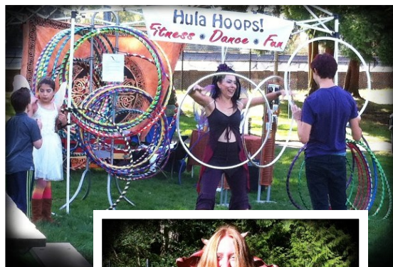
COSTUMES COSPLAY AND FANTASY EMPOWER YOUTH